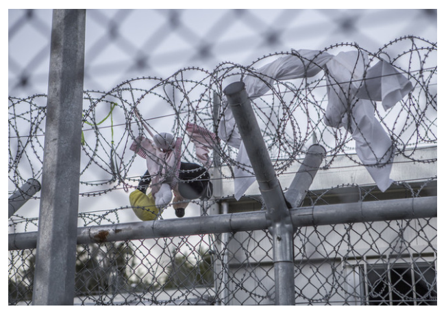
A toy stuck in the razor wire that hugs Moria camp in Lesvos, Greece.

Interviews conducted with Save the Children staff and refugee and migrant families on the Greek islands reveal the devastating impact that the EU-Turkey Deal has had on children's mental and physical well-being and their development so far. Self-harm, drug abuse and depression are just some of the many issues plaguing children stranded in limbo, as a result of the EU-Turkey Deal.