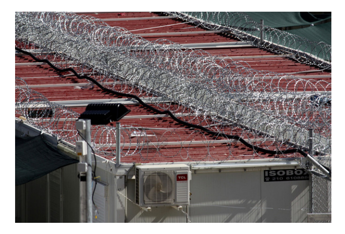
The hotspot on the Greek island of Leros is located on the grounds of a psychiatric hospital. Many families have been living in the centre for months as they wait for their asylum applications to be processed. Some families are choosing to return home because conditions in the center are so terrible.

"Unaccompanied children are forced to look for smugglers because they are trapped. They don't realize how much danger they are putting themselves in, and the risk of trafficking."