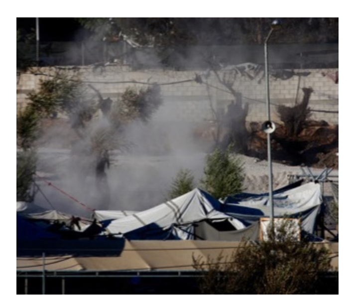
On 19 September 2016, a large fire caused extensive damage to Moria detention centre on the Greek island of Lesvos. The fire destroyed tents and housing units, and left many children and families without a place to sleep.