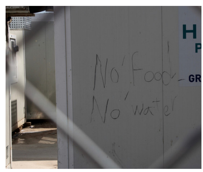
Families stranded in Vial camp on the island of Chios say conditions are terrible and that the bathrooms are dirty and sometimes don't have water.

A Save the Children staff member said: "Many parents are extremely disappointed, hopeless, depressed and stressed. They inevitably will pay less attention to their children. They're fatigued and frustrated - in some cases they've given up and this affects children who become dirty and more aggressive. Just last Wednesday, a family was moved out of the hotspot, but they were devastated and terrified that they wouldn't be able to track their asylum application that was still being processed in the hotspot. The parents were sitting on the pavement outside and sobbing. Their six-year-old child was trying to hug them and comfort them, then he started crying too, so the parents became more distraught and emotional that their child was trying to comfort them and was crying too. Seeing parents stressed makes children stressed as well."