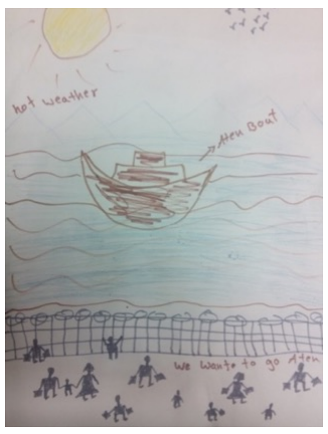
A drawing by a child attending activities in Save the Children's Child-Friendly Space in Moria, Lesvos. The drawing shows families who want to leave the island and go to Athens but are trapped under the sun, behind the barbed wire in the camp. Sacha Myers/Save the Children.